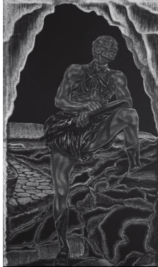
Toyin Ojih Odutola, Semblance of Certainty from A Countervailing Theory, (2019), Toyin Ojih Odutola, The Ruling Class (Eshu) from A Countervailing Theory, (2019)