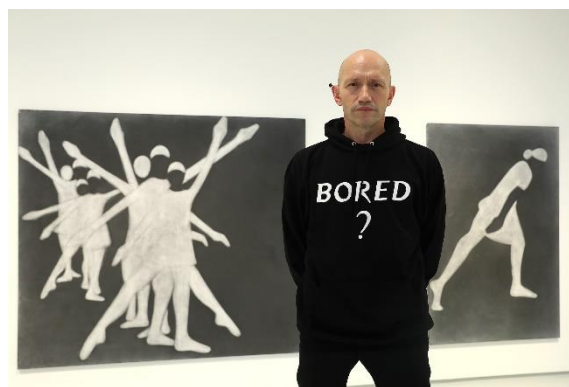
20. Michael Clark: Cosmic Dancer Michael Clark with works by Silke Otto-Knapp Barbican Art Gallery 7 October 2020 – 3 January 2021