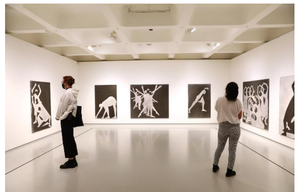
4. Michael Clark: Cosmic Dancer Installation View of Silke Otto-Knapp room Barbican Art Gallery 7 October 2020 – 3 January 2021