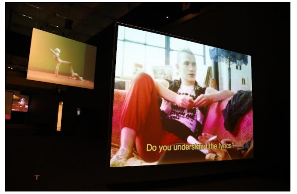
14. Michael Clark: Cosmic Dancer Installation View of A Prune Twin (2020) by Charles Atlas Barbican Art Gallery 7 October 2020 – 3 January 2021