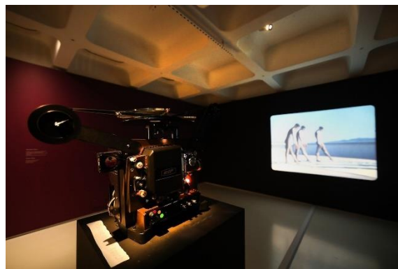
18. Michael Clark: Cosmic Dancer Installation View Barbican Art Gallery 7 October 2020 – 3 January 2021