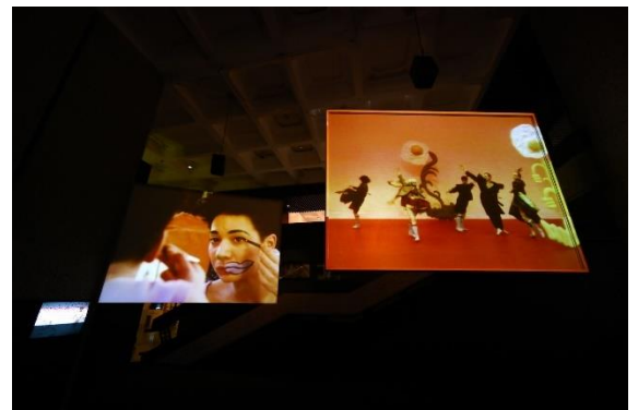
2. Michael Clark: Cosmic Dancer Installation View of A Prune Twin (2020) by Charles Atlas Barbican Art Gallery 7 October 2020 – 3 January 2021