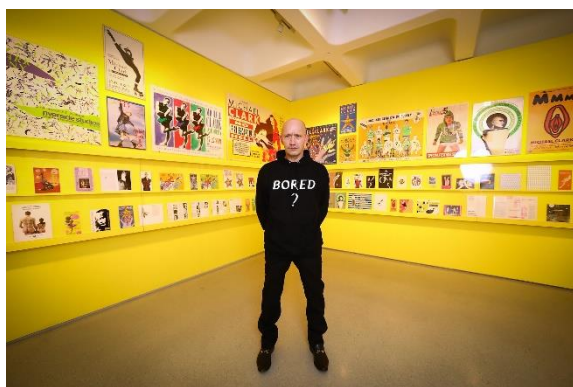
19. Michael Clark: Cosmic Dancer Portrait of Michael Clark Barbican Art Gallery 7 October 2020 – 3 January 2021