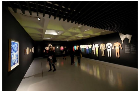
8. Michael Clark: Cosmic Dancer Installation View of room with works by Elizabeth Peyton, Leigh Bowery, BodyMap and Stevie Stewart Barbican Art Gallery 7 October 2020 – 3 January 2021