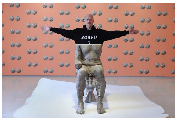
21. Michael Clark: Cosmic Dancer Michael Clark with works by Sarah Lucas Barbican Art Gallery 7 October 2020 – 3 January 2021