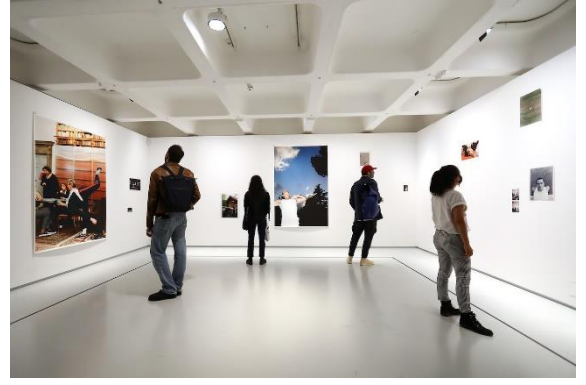
6. Michael Clark: Cosmic Dancer Installation View of Wolfgang Tillmans room Barbican Art Gallery 7 October 2020 – 3 January 2021