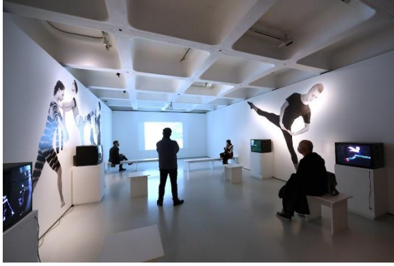
11. Michael Clark: Cosmic Dancer Installation View Barbican Art Gallery 7 October 2020 – 3 January 2021