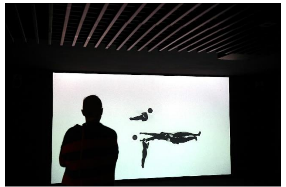
10. Michael Clark: Cosmic Dancer Installation View of It for Others (2013) by Duncan Campbell Barbican Art Gallery 7 October 2020 – 3 January 2021