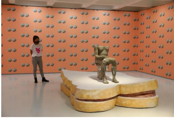
5. Michael Clark: Cosmic Dancer Installation View of Sarah Lucas room Barbican Art Gallery 7 October 2020 – 3 January 2021