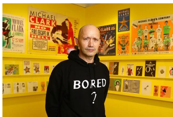
22. Michael Clark: Cosmic Dancer Portrait of Michael Clark Barbican Art Gallery 7 October 2020 – 3 January 2021

IMPORTANT CREDIT AND PICTURE INFORMATION