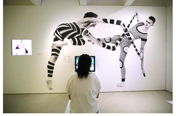
12. Michael Clark: Cosmic Dancer Installation View Barbican Art Gallery 7 October 2020 – 3 January 2021