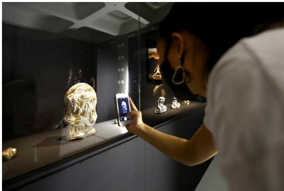
13. Michael Clark: Cosmic Dancer Installation View of Sarah Lucas room Barbican Art Gallery 7 October 2020 – 3 January 2021