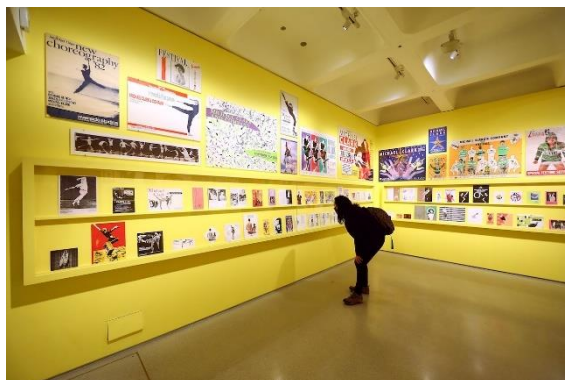
3. Michael Clark: Cosmic Dancer Installation View Barbican Art Gallery 7 October 2020 – 3 January 2021