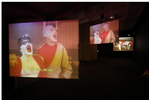
17. Michael Clark: Cosmic Dancer Installation View of A Prune Twin (2020) by Charles Atlas Barbican Art Gallery 7 October 2020 – 3 January 2021