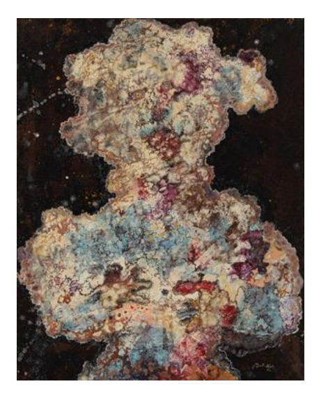
Left: Jean Dubuffet in Paris, France, 1972. Photograph by Francis Chaverou © Archives Fondation Dubuffet, Paris / © Francis Chaverou Right: Jean Dubuffet, The Extravagant One ( L'Extravagante ) July 1954, Private Collection © ADAGP, Paris and DACS, London 2020

'Art should always make you laugh a little and fear a little. Anything but bore'.