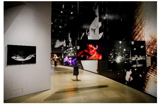
14. Claudia Andujar : The Yanomami Struggle Installation view The Curve and The Pit 17 June – 29 August 2021