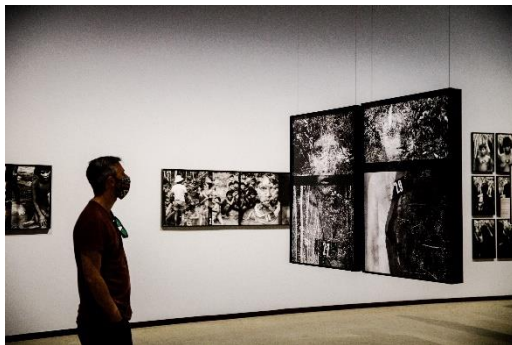
17. Claudia Andujar : The Yanomami Struggle Installation view The Curve and The Pit 17 June – 29 August 2021