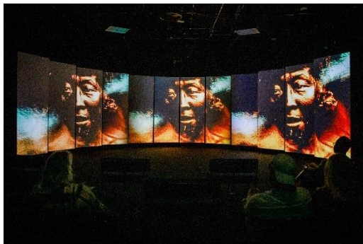
11. Claudia Andujar : The Yanomami Struggle Installation view The Curve and The Pit 17 June – 29 August 2021