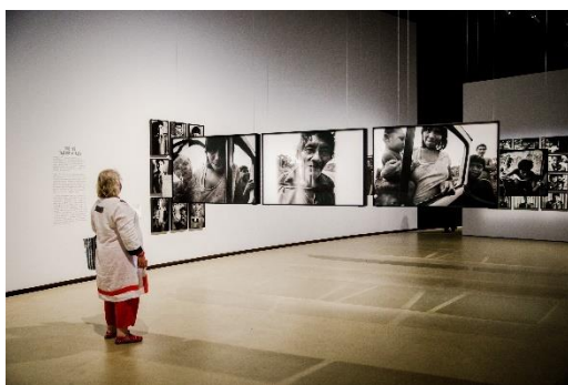
19. Claudia Andujar : The Yanomami Struggle Installation view The Curve and The Pit 17 June – 29 August 2021