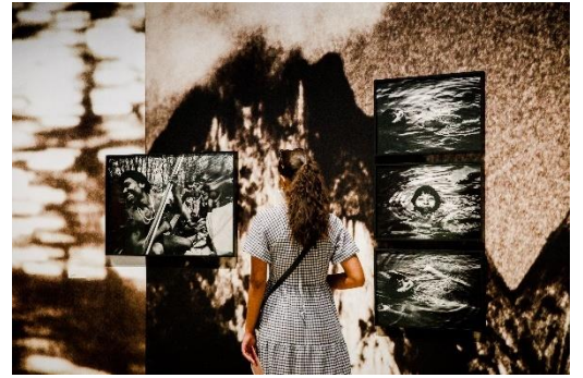
8. Claudia Andujar : The Yanomami Struggle Installation view The Curve and The Pit 17 June – 29 August 2021