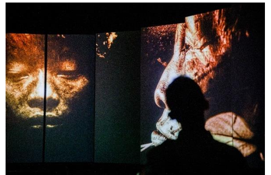
12. Claudia Andujar : The Yanomami Struggle Installation view The Curve and The Pit 17 June – 29 August 2021