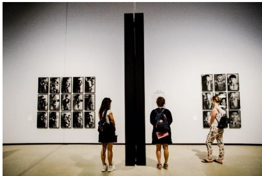
15. Claudia Andujar : The Yanomami Struggle Installation view The Curve and The Pit 17 June – 29 August 2021