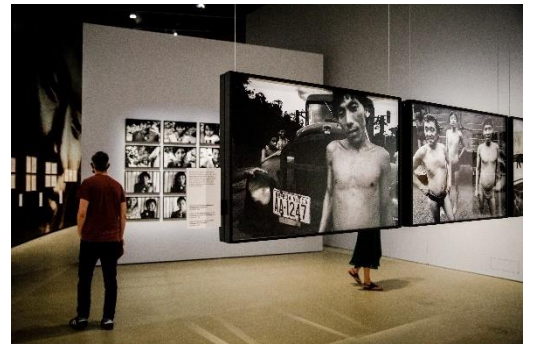
10. Claudia Andujar : The Yanomami Struggle Installation view The Curve and The Pit 17 June – 29 August 2021