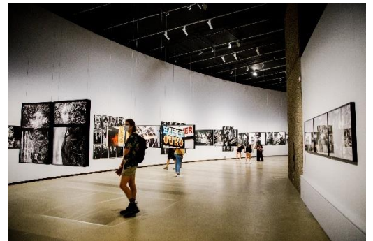
18. Claudia Andujar : The Yanomami Struggle Installation view The Curve and The Pit 17 June – 29 August 2021