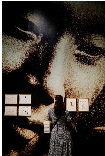
9. Claudia Andujar : The Yanomami Struggle Installation view The Curve and The Pit 17 June – 29 August 2021