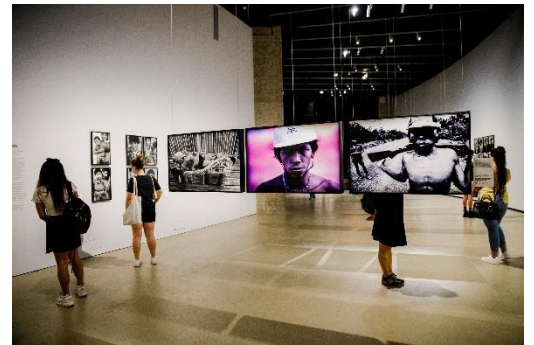
16. Claudia Andujar : The Yanomami Struggle Installation view The Curve and The Pit 17 June – 29 August 2021