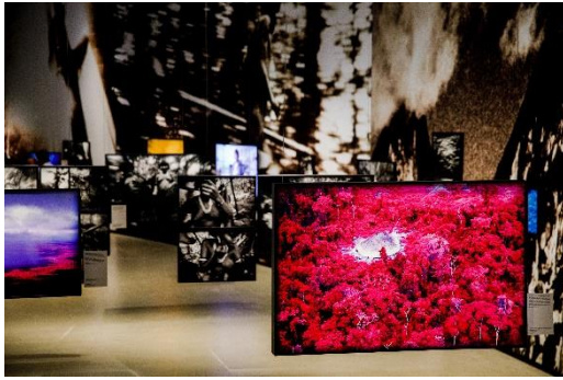
7. Claudia Andujar : The Yanomami Struggle Installation view The Curve and The Pit 17 June – 29 August 2021