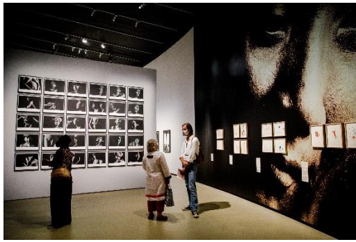
13. Claudia Andujar : The Yanomami Struggle Installation view The Curve and The Pit 17 June – 29 August 2021