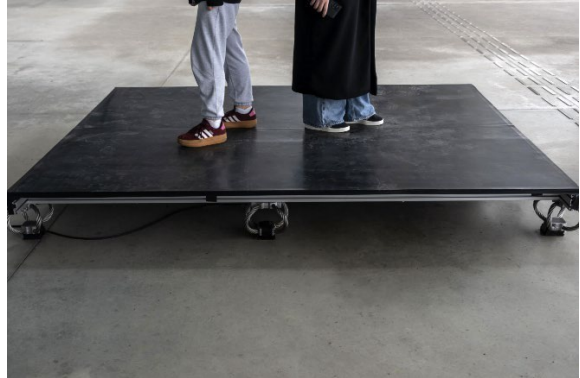
6. Embodied Listening Playground Jan St. Werner, Vibraceptional Plate , 2024.