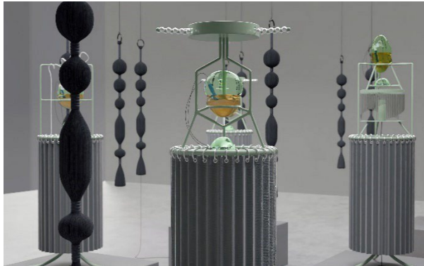
5. Embodied Listening Playground Amor Muñoz, CHIMERA-Expanded Bodies , 2022. Interactive sound installation. Metal, electronics, living matter (SCOBYS), speakers, textile, glass. Variable dimensions. Photo: Violetta Wakolbinger

Evelyn Glennie, Teach the World to Listen , 2025 © Stephen Iliffe / Deaf Mosaic - photo ref Waterphone Montage