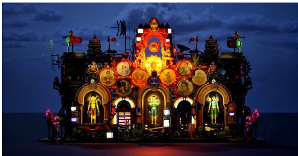
7. Resonance Continuum Elsewhere In India, Resonance Continuum , 2025. Animation Still