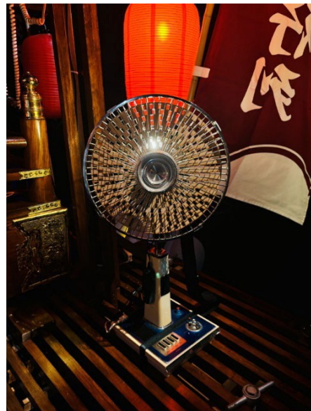
8. Sonic Listening Playground ELECTRONICOS FANTASTICOS! / Ei Wada, Electric Fan Harp , 2016-.